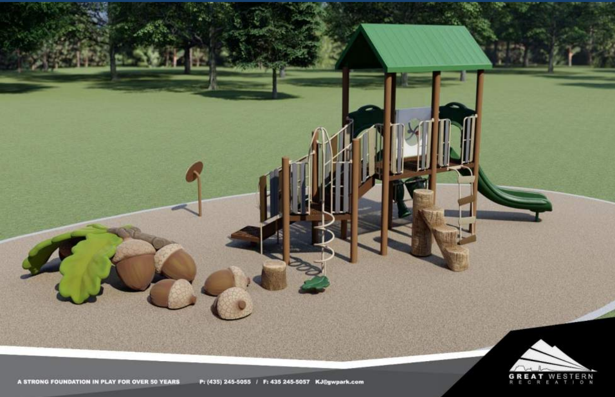
Option #1 - Clubhouse