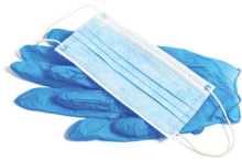
DISPOSABLE GLOVES & MASKS