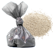
PET WASTE & KITTY LITTER

* PLASTIC BAG OR FILM RECYCLING: PLEASE VISIT PLASTICFILMRECYCLING.ORG FOR PLASTIC BAG AND FILM RECYCLING SOLUTIONS AND POSSIBLE DROP-OFF LOCATIONS NEAR YOU.