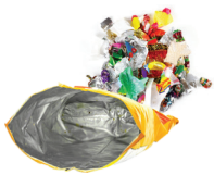
SNACK BAGS & CANDY WRAPPERS