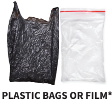
PLASTIC BAGS OR FILM*