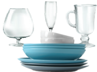
BROKEN GLASSWARE & DISHES