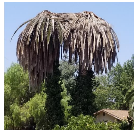
Dieback of infested palm fronds.

Infested trees are more likely to litter fruit, fronds, and other plant material. If the infestation is not managed, trunk breaking or crown toppling has been reported. Unmanaged trees present a safety risk if infested trees are in yards, streets, and other urban areas.